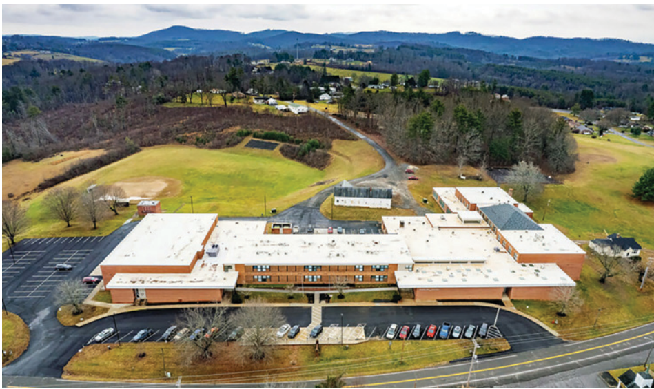
Woodlawn School in Carroll County, Va., closed in 2013 and has since been converted into 51 affordable apartments. The county owned the land and was able to donate it to the developers.